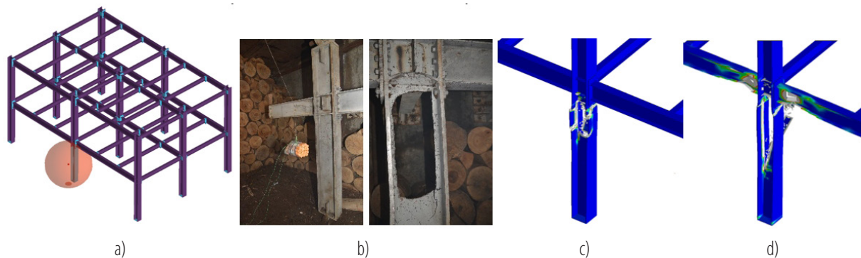
Fig. 3 Numerical simulations using ELS: